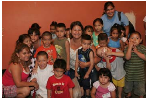
Moms' Place graduates giving back to the community, serving as teachers this summer at Kids' Club